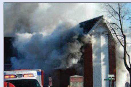
In a recent claim involving a $2.7 million fire loss to a church building and fellowship hall, the extra bill for claims-related expenses and the cost to upgrade facilities to meet current building code totalled over $800,000!

a reconstruction period, they may incur significant extra expenses to operate, including: - Recreating valuable papers and records - Moving salvaged contents and renting storage facilities - Telephone, media and computer hook-ups - Changes to stationery supplies and website content - Rental of alternate temporary facilities which may involve multiple locations for church services, Christian education, mid-week activities and office facilities - Business Interruption may be even more challenging and costly for charities that operate schools, day cares and camping ministries when the rental of temporary buildings and portable generators may be the only solution to operate.